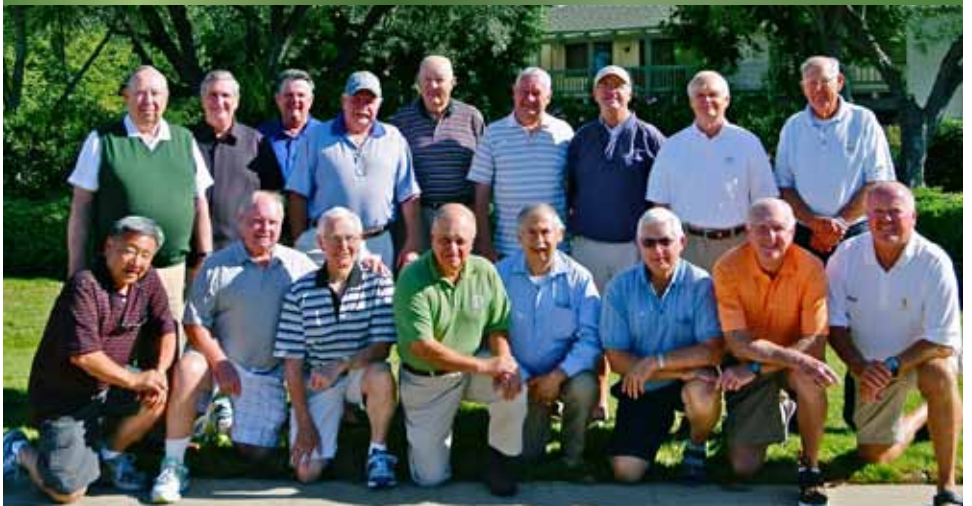
2014 Evergreen Committee